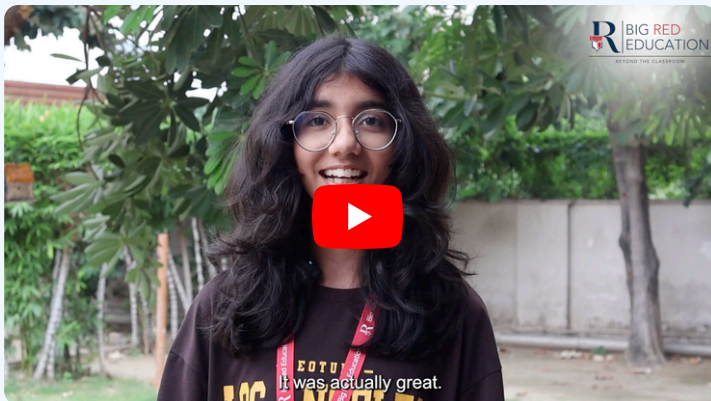
Anvi Leadership Conference alum, Heritage Xperiential Learning School